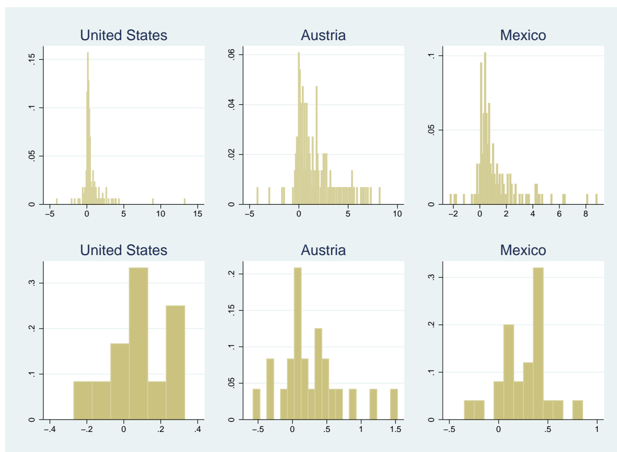
Figure 1: Distribution of CIF/FOB ratio for import country, average 2011-2015 against ROW (upper row) and against top 26 advanced economies (bottom row)

In order to illustrate this point, we pick one representative from advanced countries